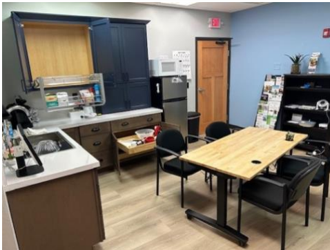
Independent Living Training and Technical Assistance Center